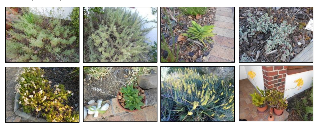
(Photos in order of the text, marked * - left to right, top and bottom)

Some of the plants in the water-wise section at Kirstenbosch that are also thriving in our garden are Artemesia afra* (Wormwood); Eriocephalus africanus* (Wild rosemary), Crassula perfoliata* which is easy to grow from cuttings and produces a bright red flower, Lampranthus deloides* with attractive leaves and a pink flower in Spring. Crassula rubicaulis* has beautiful red-rimmed leaves and pale pink flowers. There are also various very happy Hawthornia* which are busy flowering at the moment.