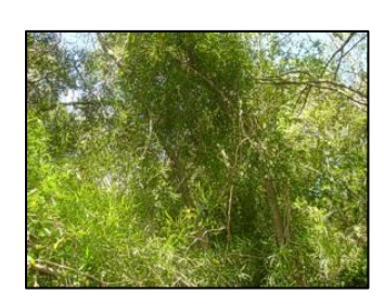
The beast. Asparagus falcatus

How did I come across Beauties and Beasts? Either they're just absolutely enormous, complete hooligans in the garden or they're very, very hardy – you can't do a thing to kill them or they have thorns or they're challenging to grow. Beauties are just gorgeous and there's something pretty about them."