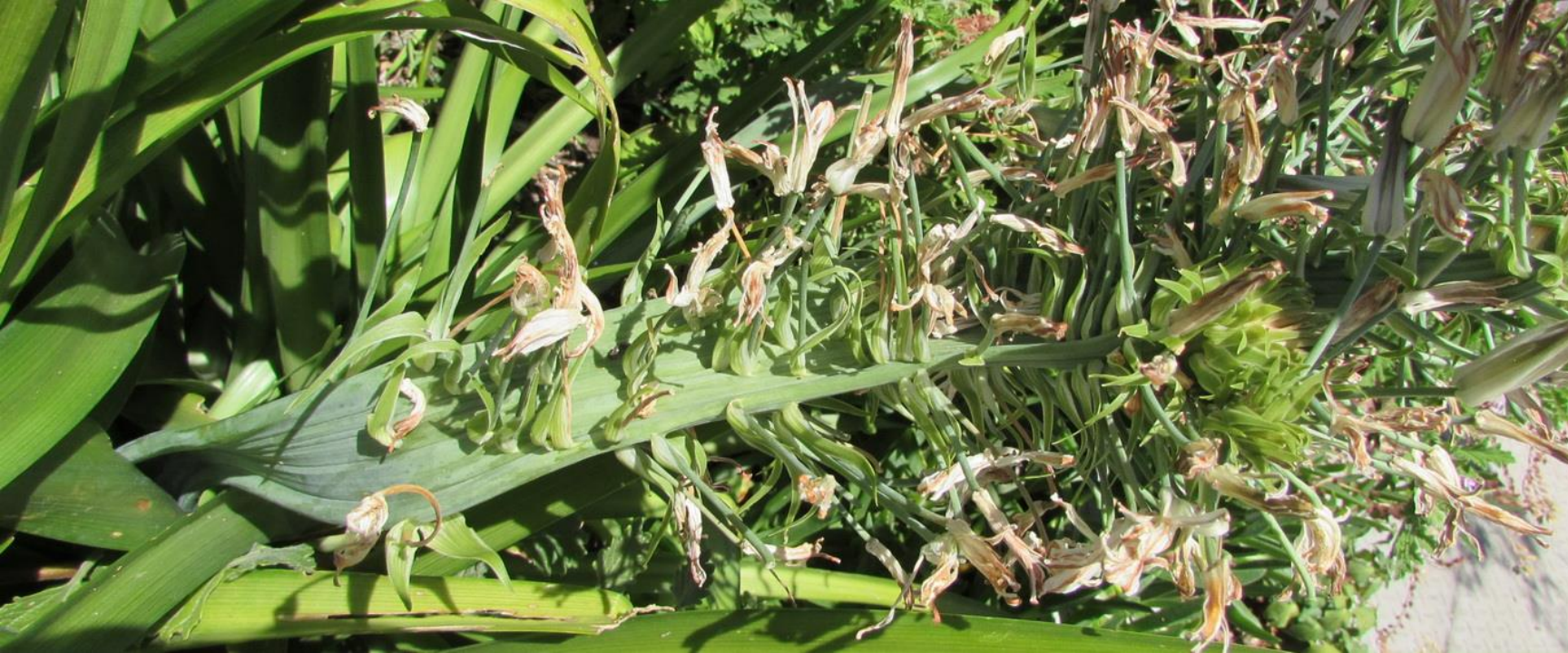
Albuca nelsonii – fasciated flower stems