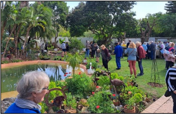
Left: the buyers