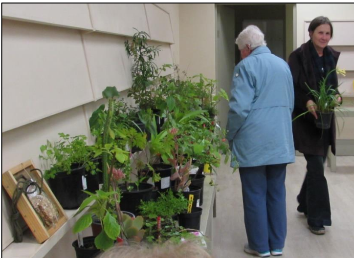
Above, left: Admiring the array of prizes